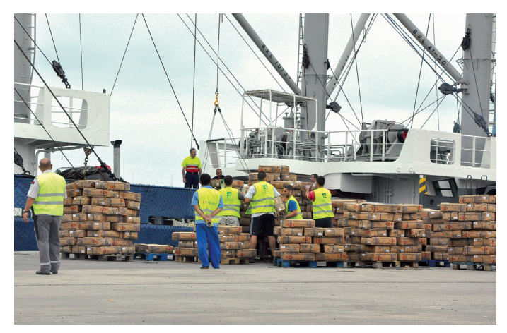
Dock workers organising frozen fish into boxes in Las Palmas

The EU IUU Regulation has great potential to stop the trade in illegal fish products into the world's largest seafood market and so discourage IUU fishing worldwide, but it is critical that it is fully implemented.