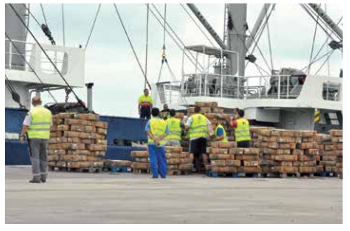
Dock workers organising frozen fish into boxes in Las Palmas

The EU IUU Regulation has great potential to stop the trade in illegal fish products into the world's largest seafood market and so discourage IUU fishing worldwide, but it is critical that it is fully implemented.