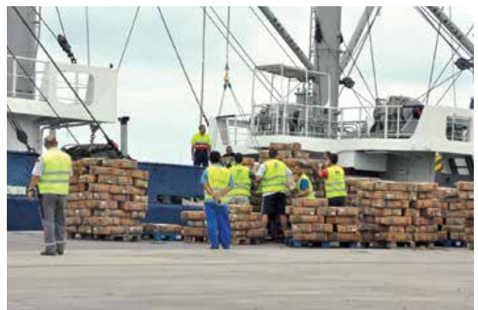
Dock workers organising frozen fish into boxes in Las Palmas

The EU IUU Regulation has great potential to stop the trade in illegal fish products into the world's largest seafood market and so discourage IUU fishing worldwide, but it is critical that it is fully implemented.