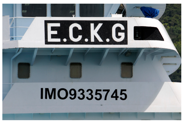
Vessel clearly displaying IMO number.

The 31st session of the United Nations Food and Agriculture Organization (FAO) Committee on Fisheries (COFI) agreed that the IMO number should be used as the UVI for Phase I of the Global Record of Fishing Vessels, Refrigerated Transport Vessels and Supply Vessels (the Global Record)8. UVIs are recognised as a prerequisite for the successful implementation of the Global Record9, the aim of which is to gather and disseminate verified information on vessels used for fishing and fishing-related activities, to assist in the global fight against IUU fishing.