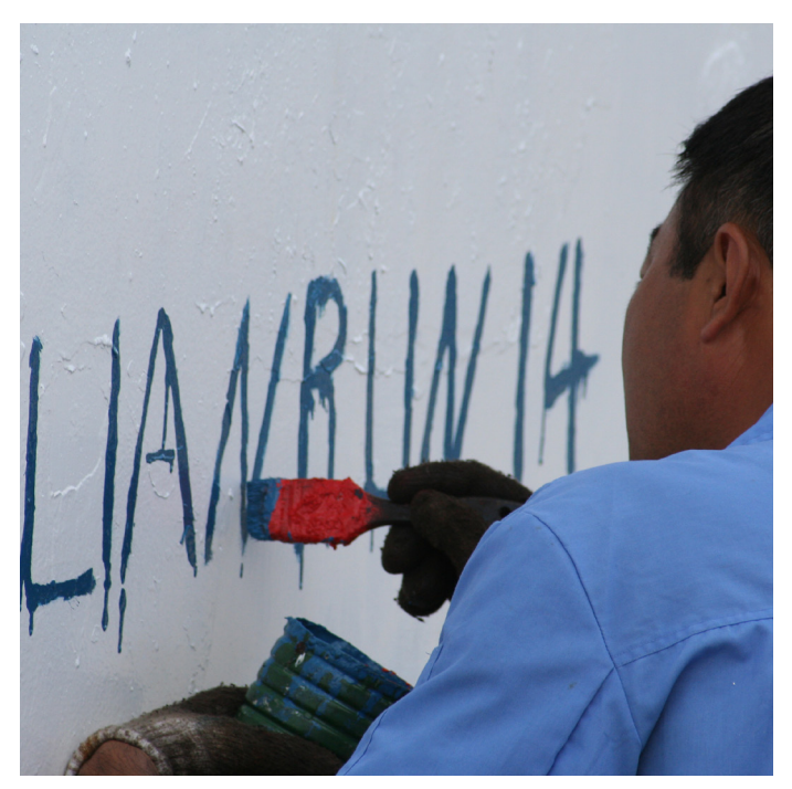
Vessel name being re-painted.

Mandating the inclusion of IMO numbers in catch certificates would also allow member states to assess rapidly whether RFMO requirements for IMO numbers have been complied with for a given vessel, and thus whether products should be authorised for import into the EU.