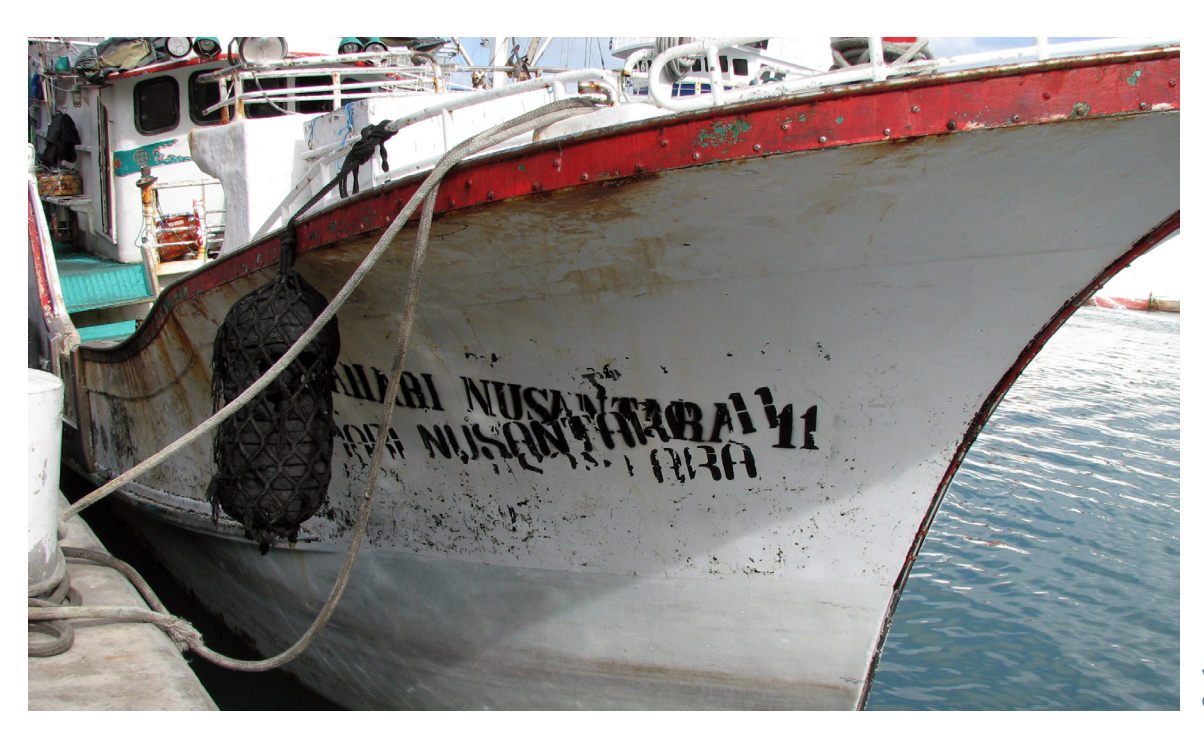
Vessel with illegible name.

"Legitimate objectives" set out in the TBT agreement appear to encompass the objectives of a catch certificate scheme, for example, national security, the prevention of deceptive practices and protection of the environment. In addition, technical regulations based on international standards attract a presumption that they are <u>not</u> an unnecessary obstacle to international trade (a presumption which may, however, be refuted by evidence to the contrary)<sup>25</sup>. Proliferation of mandatory IMO requirements within key RFMOs, as well as the requirements established under the EU Control Regulation, represent major steps towards an international standard. This is further supported by progress at the international level on the Global Record and the acceptance of IMO numbers as the UVI for this purpose.