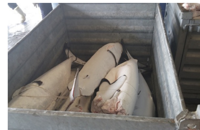
Frozen fish consignment, EU port.

As a result of a strict documentary check of all CCs received, underpinned by a well-established risk analysis, MS-A is able to efficiently identify high-risk consignments and carry out verifications that may prompt the rejection of IUU products.