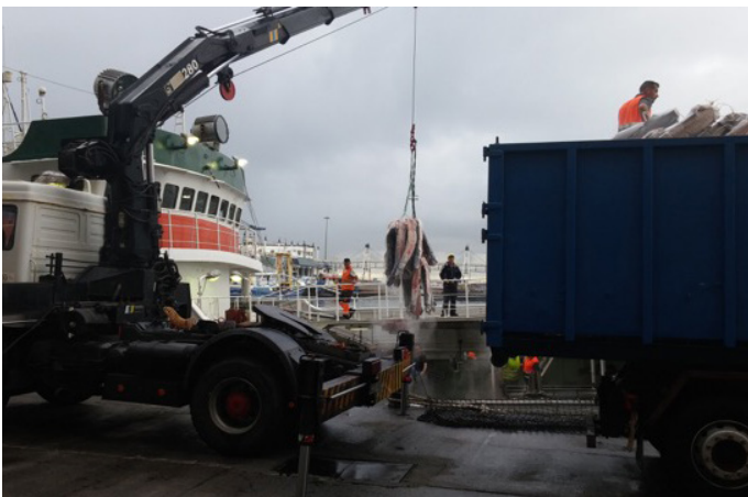
Inspection of a longliner in an EU port.

The EU's ground-breaking legislation to end IUU fishing – the EU IUU Regulation – entered into force in 2010. The IUU Regulation establishes a CC scheme, which aims to ensure that products originating from IUU fishing activities are prevented from entering the EU market.