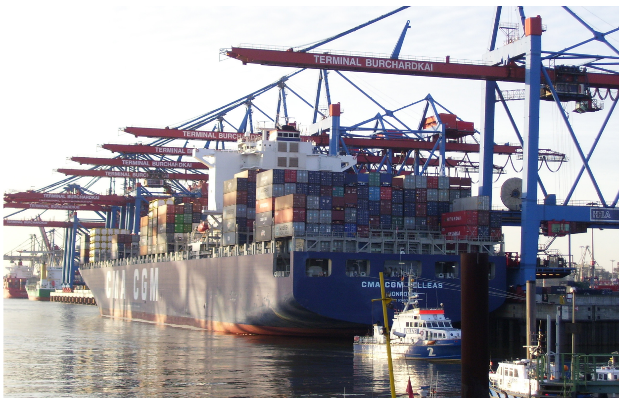
Seafood containers among mixed cargo, EU port.

The establishment of the EU-wide database, incorporating a robust risk analysis tool, provides a crucial opportunity to standardise procedures for the risk-based verification of CCs across member states. As such, the harmonisation of procedures across member states should be achieved by the end of 2017, in line with the establishment of this system (see under Recommendation 1 above). In order to accomplish this objective, EU member states must commit to the full and systematic use of the database once established.